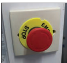
Emergency stop button