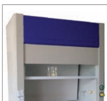
External hood colour variations