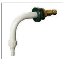
Water faucet type and location