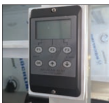
Digital airflow display/airflow regulator