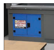
Flammable/corrosive chemical safety cabinet