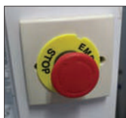
Emergency stop button