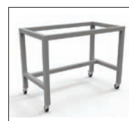
Base support frame with castors