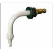
Water faucet type and location