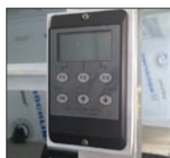
Digital airflow display/airflow regulator