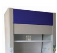
External hood colour variations