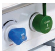
Gas outlet/valve type and location