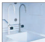
Sink and additional water faucet