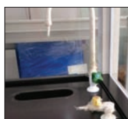
Drip cup, water faucet type and location